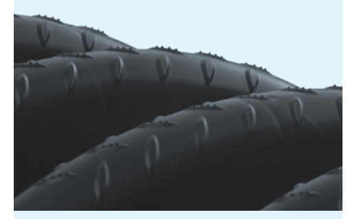
Diamond Plate Texture